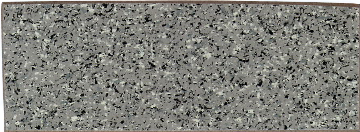
GRAYSTONE - 33 with Pewter Base Color

Base paint colors are Marbelite Stain Seal 500 color samples shown will vary in color, texture and finish due to jobsite conditions, equipment and method of application