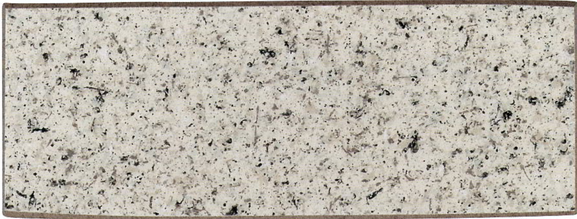
LIGHT GRANITE - 21 with Almond Sand Base Color